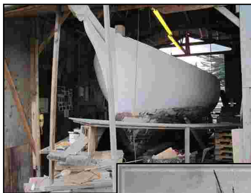
Above: Golden Rule currently being refurbished.